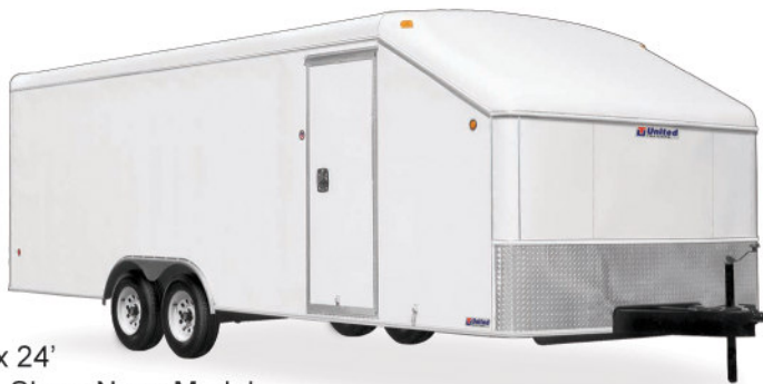
8.5' x 24' USN Slope-Nose Model