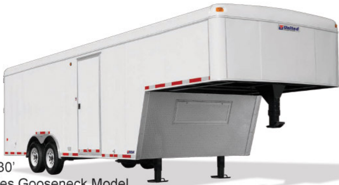
8.5' x 30' U-Series Gooseneck Model