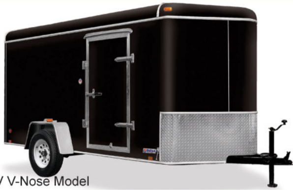
6' x 12' UV V-Nose Model