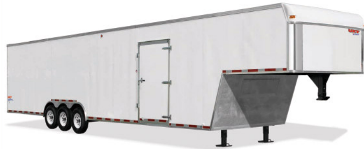
8.5' x 44' UXT Gooseneck Model