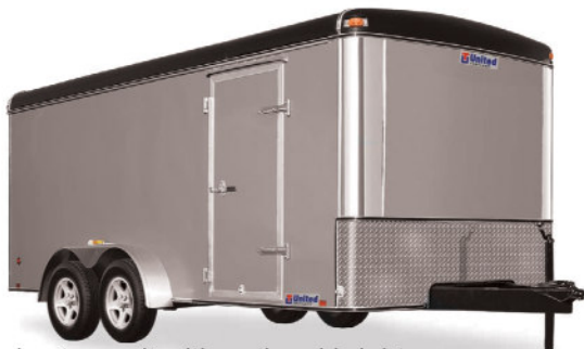
7' x 16' U-Series tag unit with optional bright aluminum front corners and aluminum Star wheels.

Units may be shown with optional features. We reserve the right to change specifications at any time, without incurring obligation. Please see your dealer for current standard specifications and options. Thank you!