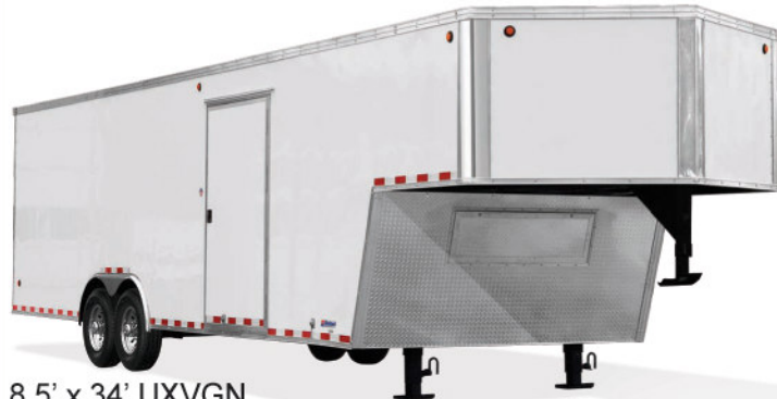
8.5' x 34' UXTVGN