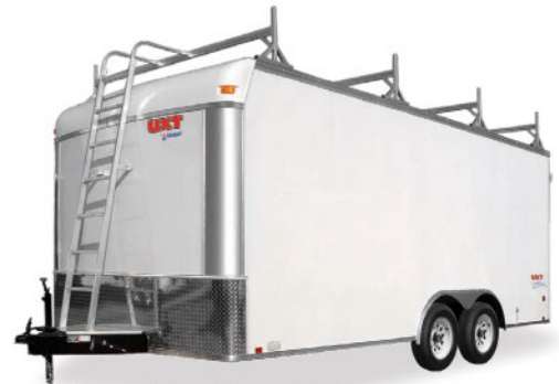
UXT 8.5' x 18' with optional ladder racks and ladder.