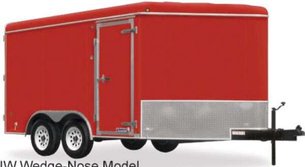
8.5' x 17' UW Wedge-Nose Model The wedge-nose models come with a 5' wedge.